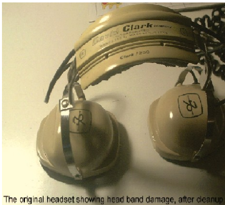
The original headset showing head band damage, after cleanup

Like many, I prefer listening to headphones when working dx. They seem to bring out the hard to copy signals in many cases and if they happen to have a noise canceling feature, then that's all the better. I was unhappy with the electronic noise reduction on my present headset as well as others I had tried over the years. I like to isolate myself from room noise and distractions as much as possible and most of the headsets I have used, while comfortable and responsive, failed to meet the grade when working beside another operator during Field Day. Then it all came back to me.