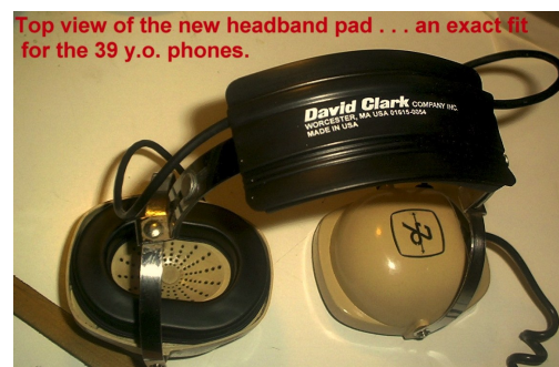
Top view of the new headband pad . . . an exact fit for the 39 y.o. phones.

So for $20 in parts and shipping, I'm back in business . . . . enjoying a TRUE noise canceling headset that seems tailor made for listening to voice frequencies. In addition, I made a few points with my lovely wife. And you can't even begin to put a price on that now, can you?