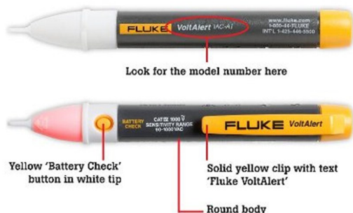
Fluke 1AC-I VoltAlert™ Voltage Tester First released for sale on September 29, 2009

Consumers should stop using the recalled product immediately and contact Fluke for a free replacement.”