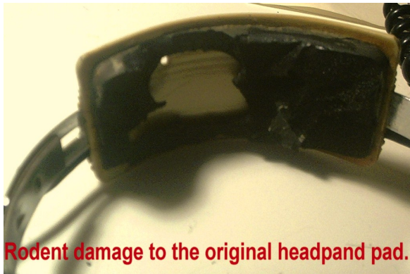
Rodent damage to the original headband pad.

Over the course of this summer, I looked in various places to no avail and eventually gave up. Recently, while looking in the garage for some paint brushes, I found the headset in an open box of painting supplies, of all places. Something had nibbled away at the original foam headband and the air-filled ear pads were collapsed. I did a half decent repair on the headband using a piece of closed-cell foam and stuffed the ear pads with foam for cushioning.