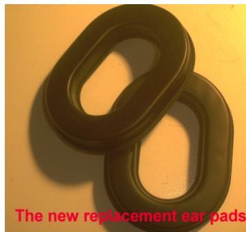
The new replacement ear pads

After a good cleaning, they were back in use but not very attractive. The XYL was proud of me for not only finding them but caring enough to fix them; she was quick to point out that she had given them to me in 1973 as a Christmas present. (How do